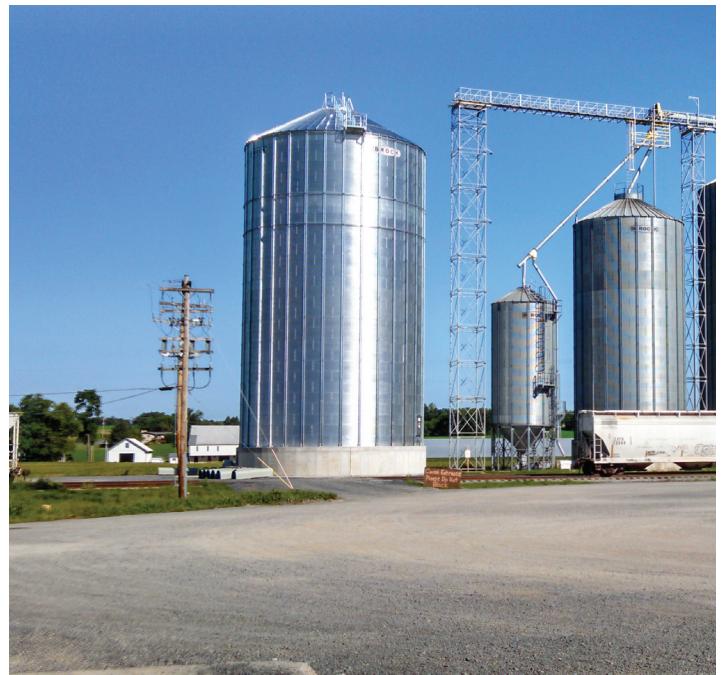
A 100,000 bushel silo to store organic corn (above) and eight 100-ton storage tanks for soft stock ingredients were recently being installed at the Shippensburg Mill.