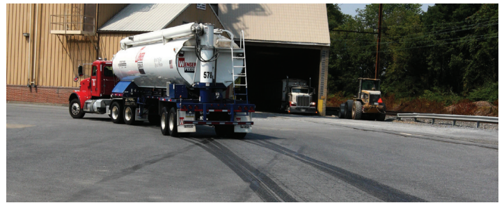
New onboard disinfecting units provide better wheel coverage to help protect your biosecurity.